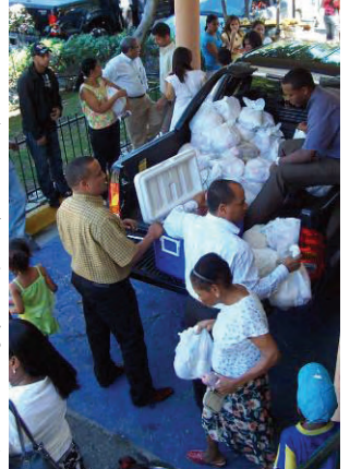
Distributing food bags to the poor after morning service at Iglesia de Comunidad

The evangelical church in the D.R. is maturing, and moving forward with ministry expansion on many fronts. It was exciting to see them determined to follow God's leading and call, and to invite us to come alongside them in the work — rather than to be dependent on American church "foreign aid", so to speak. They have already acquired a property with a large house needing tons of TLC. Plans for refurbishing it, as well as erecting the other buildings on the site, are on the drawing boards.